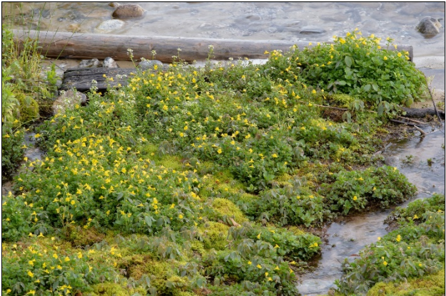
MONKEYFLOWER, OLD SETTLERS PARK, BURDICKVILLE

For maps and information, stop in at the Philip A. Hart Visitor Center located at the eastern edge of the Village of Empire (M-72 off M-22) or call 231-326-4700 , ext. 5011.