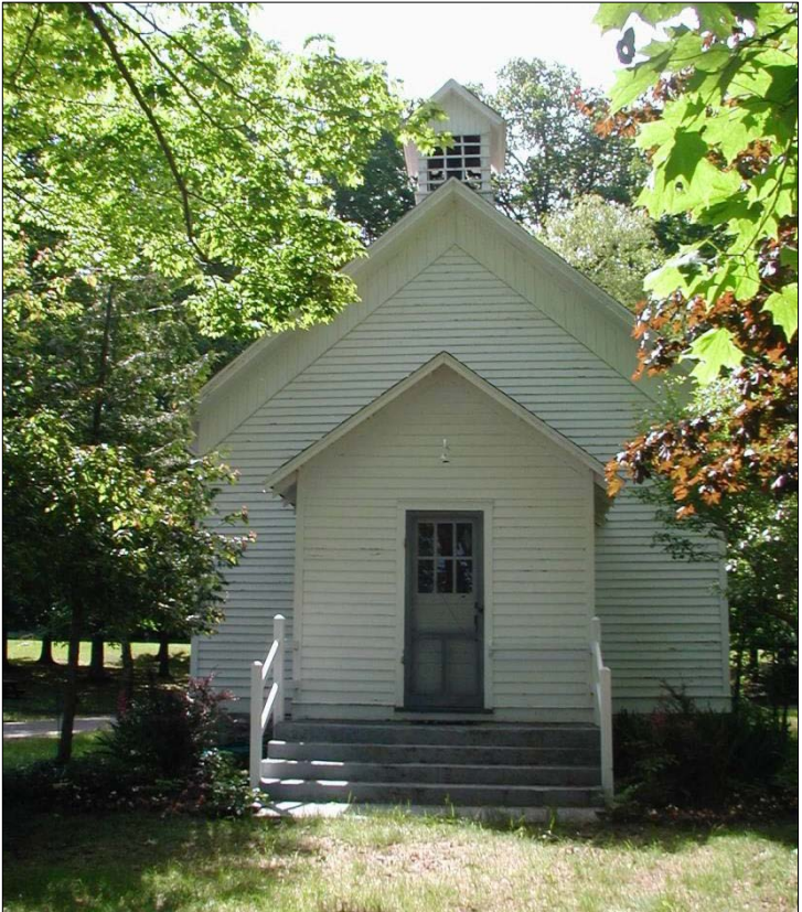
Old Settlers Chapel, Old Settlers Park, Burdickville

http://gophouse.org/representatives/northermi/omalley/contact/