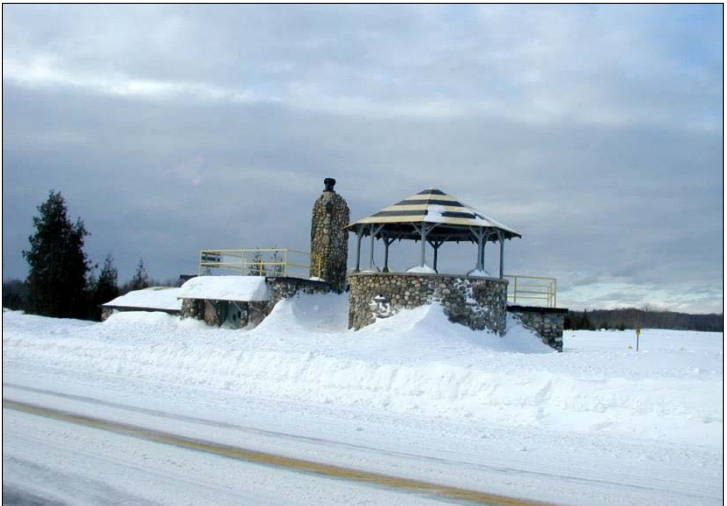
Woolsey Memorial Airport, Northport