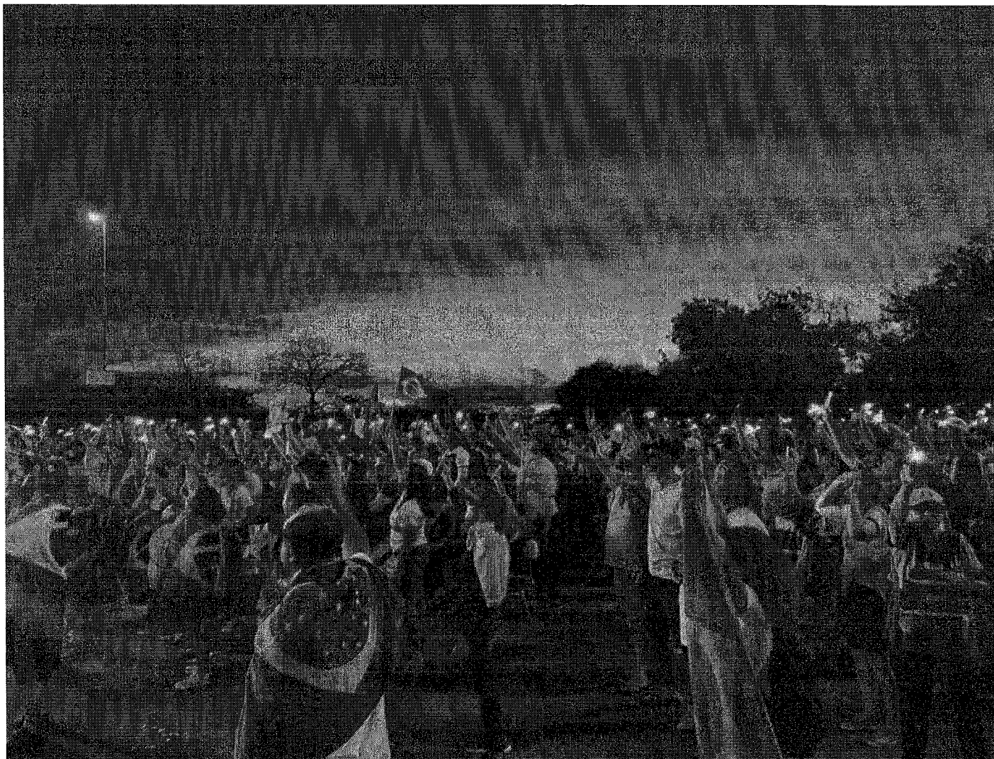
Brazilians pray for the military to save their country