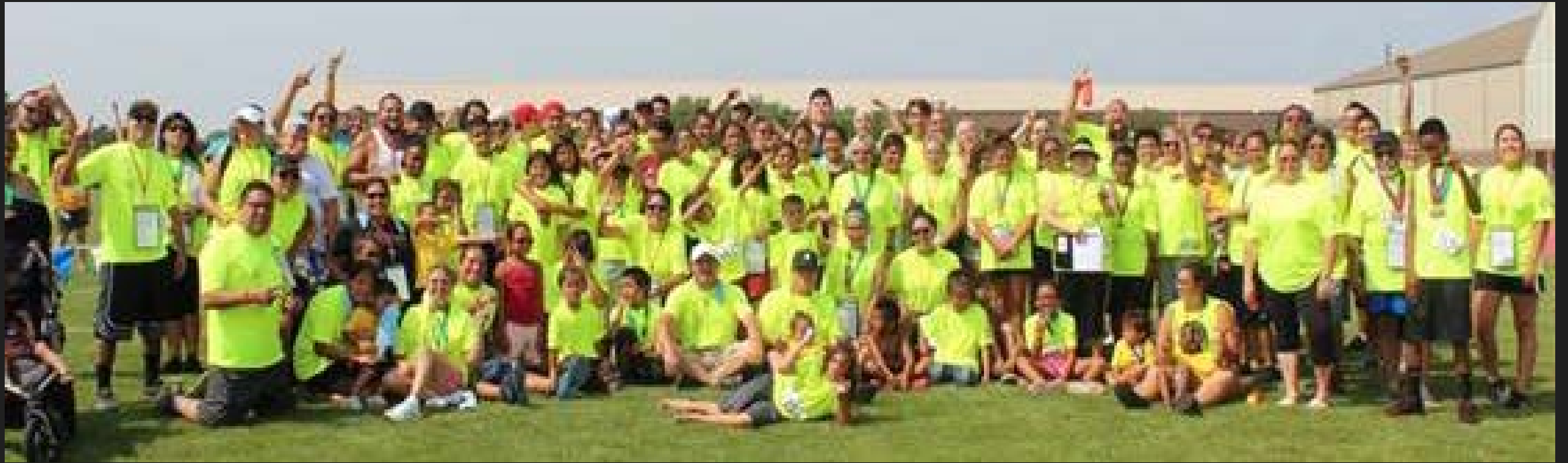
Grand Traverse Band of Ottawa and Chippewa Indians 2017 Pow-Wow

With the institution of Indigenous Peoples Day in Leelanau County, an important step has been made to recognize the dignity of those upon whose shoulders the history of this county is built.